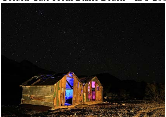
Two Shacks at Night - ISO 3200