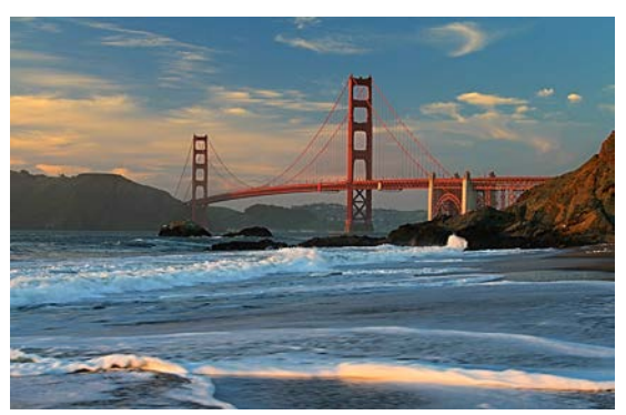
Golden Gate From Baker Beach - ISO 200

What is ISO? What does it do? Many, including me, thought that ISO stood for the International Standards Organization, but in doing research for this article I found out that organization doesn't exist, it is actually the International Organization for Standardization. This name in different languages would have different abbreviations so they standardized on ISO. So what does it do? The higher the ISO number the more sensitive the film or sensor is to light. This is the third leg of the formula to determine exposure setting. If you have a setting of f8, 1/125 at 100 ISO you can change the ISO to 200 and shoot at a higher depth of field (f11) or a faster shutter speed (1/250). This is important because sometimes in low light situations you can't have a large enough aperture opening or a slow enough speed to properly expose for the scene. The higher the ISO the more light can be captured. But, also the higher the ISO more noise shows up in the image.